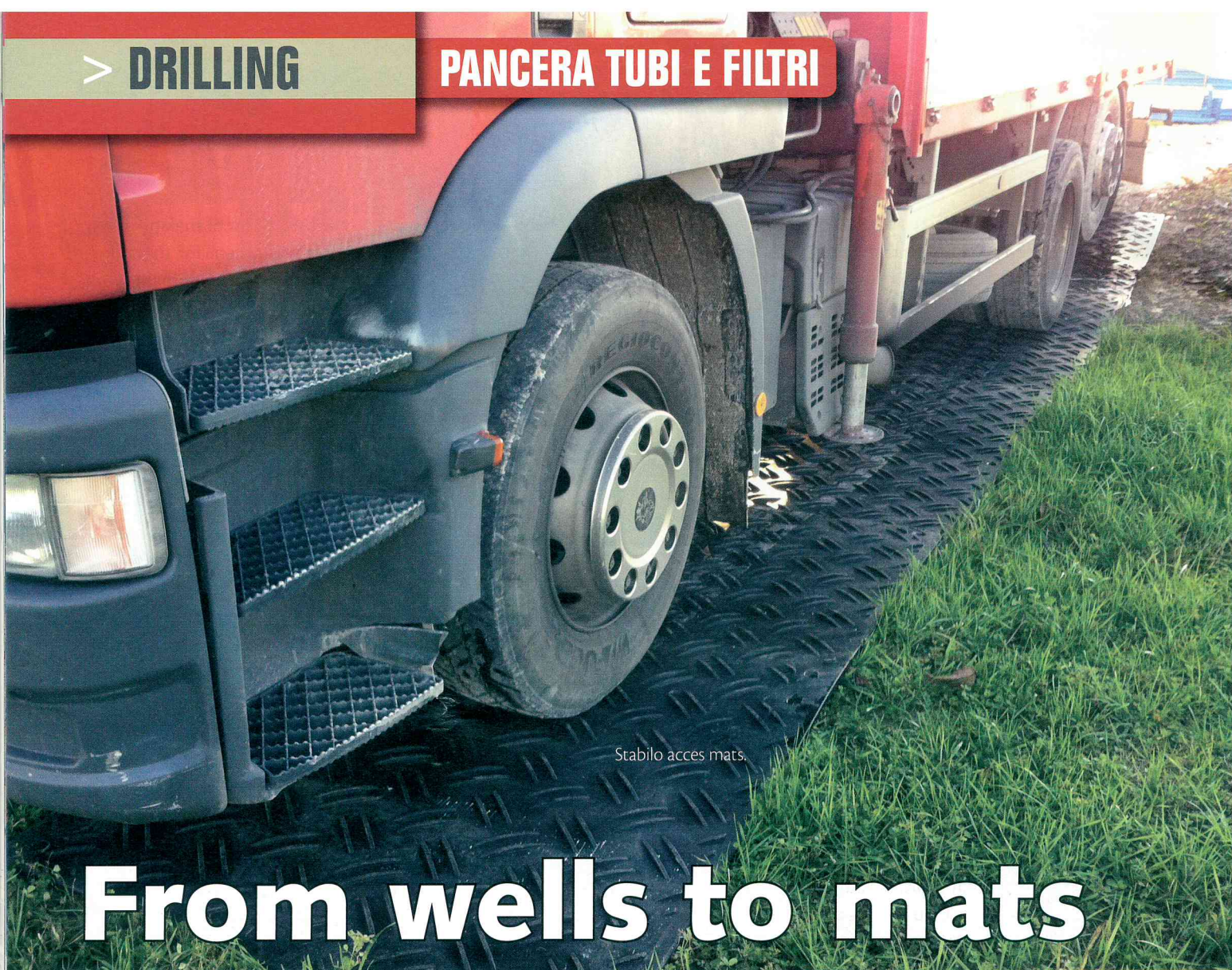
Stabilo acces mats.