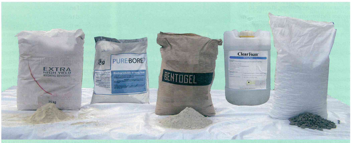
Range of drilling fluids by Pancera Tubi e Filtri.

Pancera Tubi e Filtri s.r.l. Via Zottole, 59/A 46027 San Benedetto Po (MN) - Italy Phone +39 0376 615690 Fax +39 0376 621539 office@panceratubi.it www.panceratubi.it